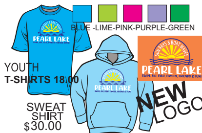
YOUTH T-SHIRTS 18.00 SWEAT SHIRT $30.00