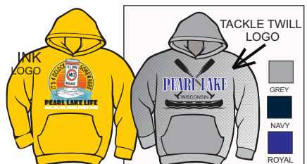
CREW NECK SWEATSHIRT $35.00 HOODY SWEATSHIRTS $39.00