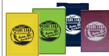
DECKS OF CARDS