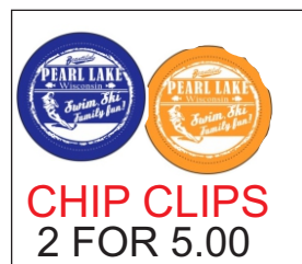
CHIP CLIPS 2 FOR 5.00