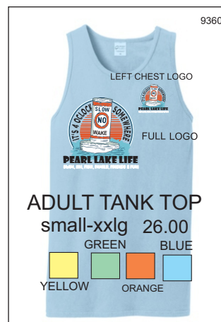
ADULT TANK TOP

* TACKLE TWILL AVAILABLE ONLY ON ADULT SWEATSHIRTS