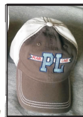
PL LOGO AS SHOWN ABOVE