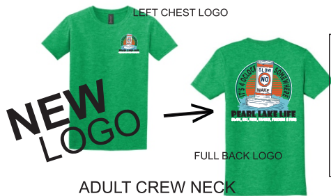
ADULT CREW NECK T-SHIRT $26.00

PLEASE HAVE ORDERS IN ON TIME OR IT MAY RESULT IN A SHIPPING CHARGE